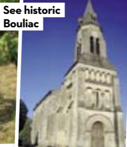
See historic Bouliac