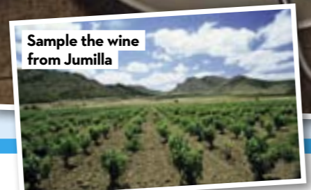
Sample the wine from Jumilla