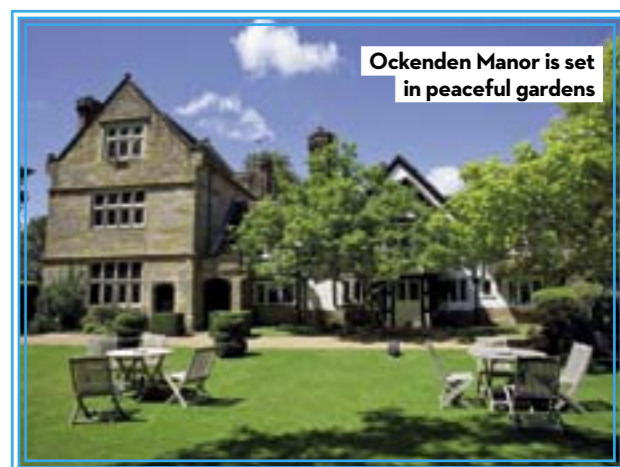
Ockenden Manor is set in peaceful gardens

a view of the surrounding vineyards. Michelin-starred chef Nicolas Magie's seasonal gourmet wonders include roasted breast of pigeon with chickpeas, caramel of citrus fruit and endive, washed down with specially selected wines! What else to do: Also known as the 'Balcony Of Bordeaux' for its panoramic views of the city, which is just ten minutes away, the village of Bouliac isn't just appealing to culinary enthusiasts – it's also a haven for avid art aficionados. Checking in: Looking out over the vineyards, Le Saint-James (www.saintjames-bouliac.com/en) – an 18th-century farmhouse transformed into a luxury retreat with 18 impeccably designed rooms – is a sight to behold. Getting there: EasyJet (www.easyjet.com) flies from Gatwick to Bordeaux from £53 return.