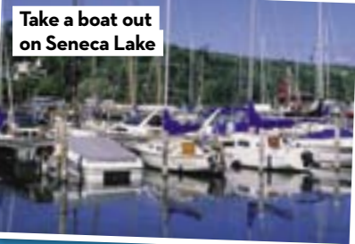
Take a boat out on Seneca Lake